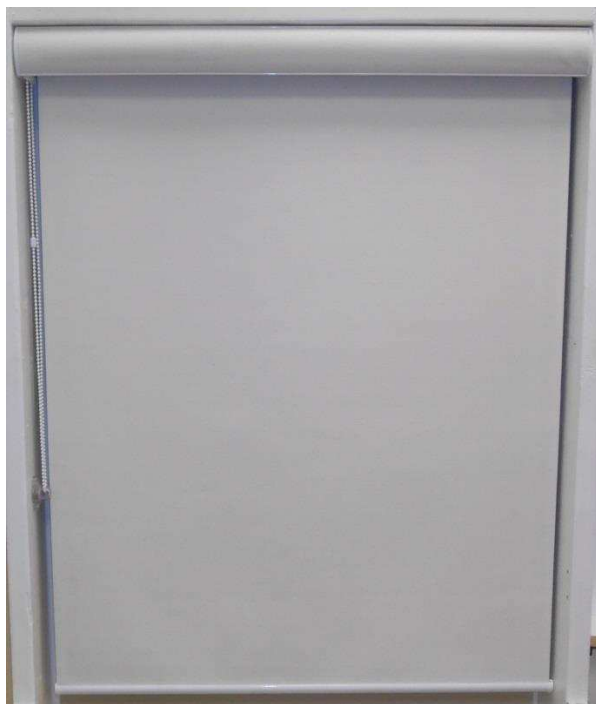
Installed Shade: Outside Mount