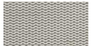
STEEL GRAY 4%