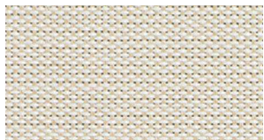
DARK BEIGE 4%