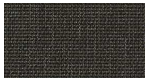
CHOCOLATE BROWN 4%