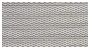
LIGHT GRAY 2% / 4%